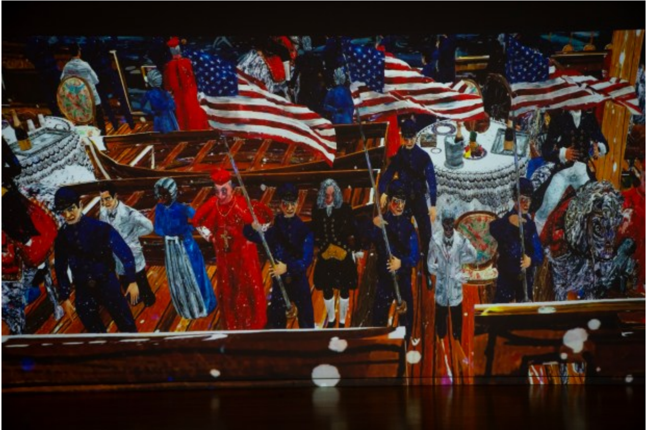
A portion of “The Great Farce” which is on exhibit at Northwestern University’s Block Museum of Art.