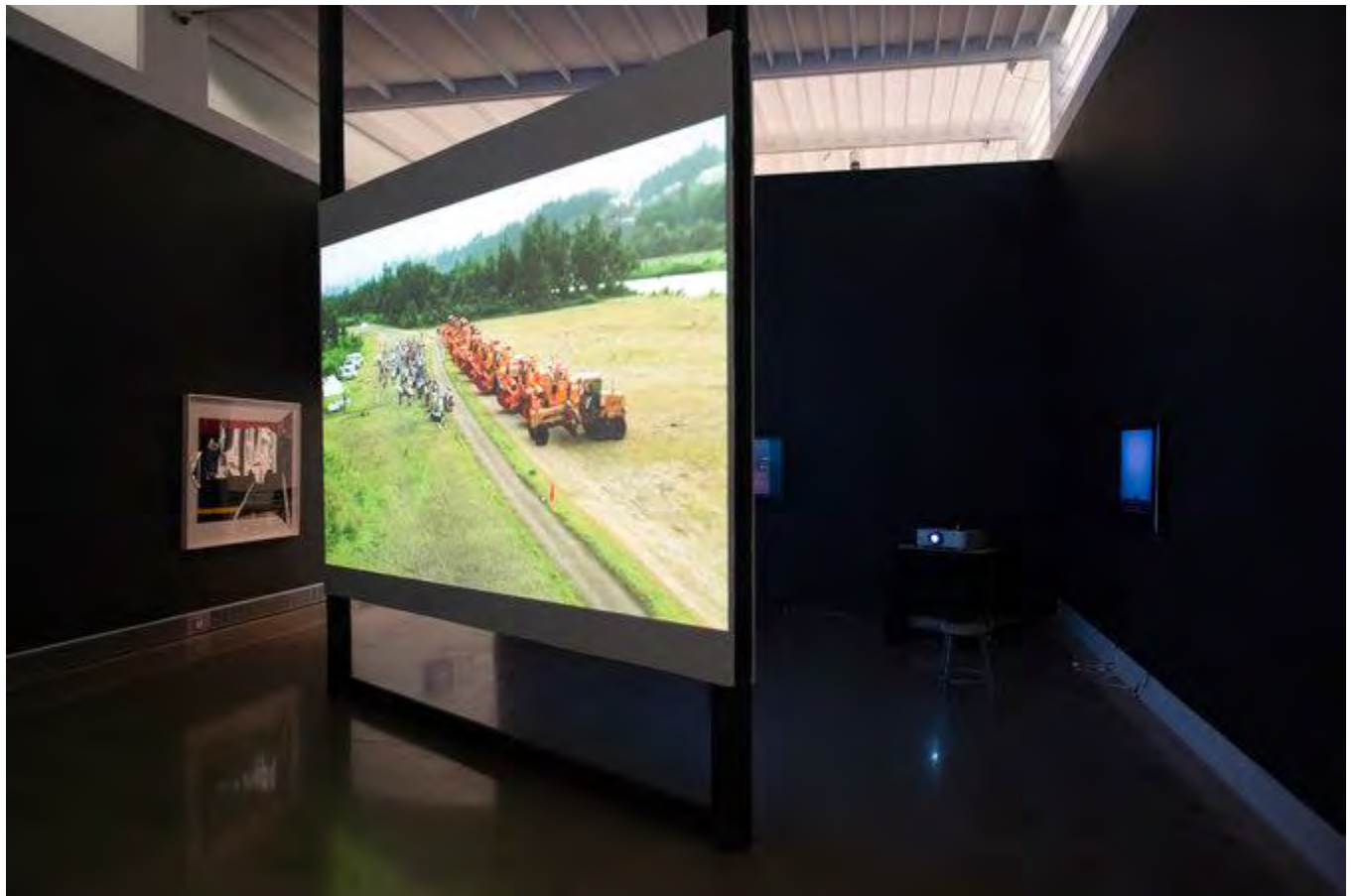
A video installation, “Snow Workers Ballet,” from a series of “Work Ballets.”