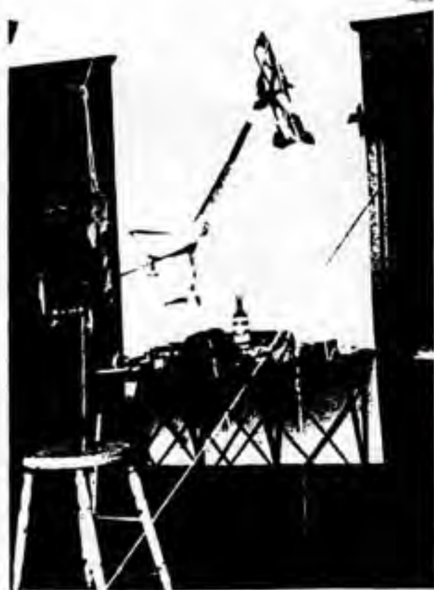
Marcel Duchamp, Sculpture of Bicycles , 1918

Ukeles' performances enable us to envision the readymades not only as everyday commodities, but as maintenance objects: objects for hanging, storing, drying, grooming, keeping tidy. If Ukeles' exposure of maintenance labor disallowed the smooth functioning of the museum, so too Duchamp's readymades altered the "proper" work of the artist's studio. But whereas Duchamp's insurgency against the tedium of both everyday domestic labor and artistic creation was evidenced by his stalling of them, hence limiting his production of art works, and the labor they involved, Ukeles knew all too well that the dust would catch up. Her mutiny took the form of her insistence that her unavoidable daily labor should work double time for double value, art and maintenance—maintenance art.