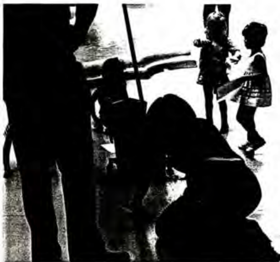
Maria Lidenman Ukeles, Hartford, Wm.: Washing Tracks, Maintenance Inside , 1973 (photo: courtesy Ronald Feldman Fine Arts).

Wish she really washed sections of the museum for hours until it was clean), the already fetishized and reified conditions of the museum are recast in relation to the maintenance of everyday life, and not the other way around. In Ukeles' bent figure, scrubbing the steps of the museum, one sees not only the secret labor required to sustain a specific cultural institution, but also countless other maintenance workers—maids, janitors, and mothers—whose largely unacknowledged and underappreciated labor sustains the daily existence of our individual and collective lives. In this way, Ukeles' performance points to the economy of labor that structures our entire society—from homes and offices, to communities, institutions, and cities.