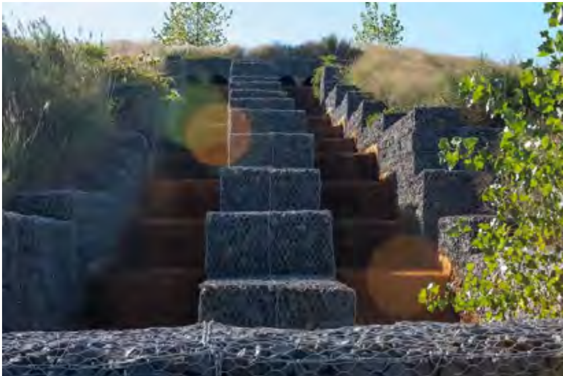
A drainage structure at the former Fresh Kills Land Fill in Staten Island, which was once the largest garbage dump in the world and is being transformed into a park.

The project, “Landing,” calls for two sculpted mounds of dirt and grass, each about 100 feet long, plus a cantilevered platform that will extend out into open space above a scenic waterway. Little has been built, since navigating the layers of municipal approval has proved a laborious process.