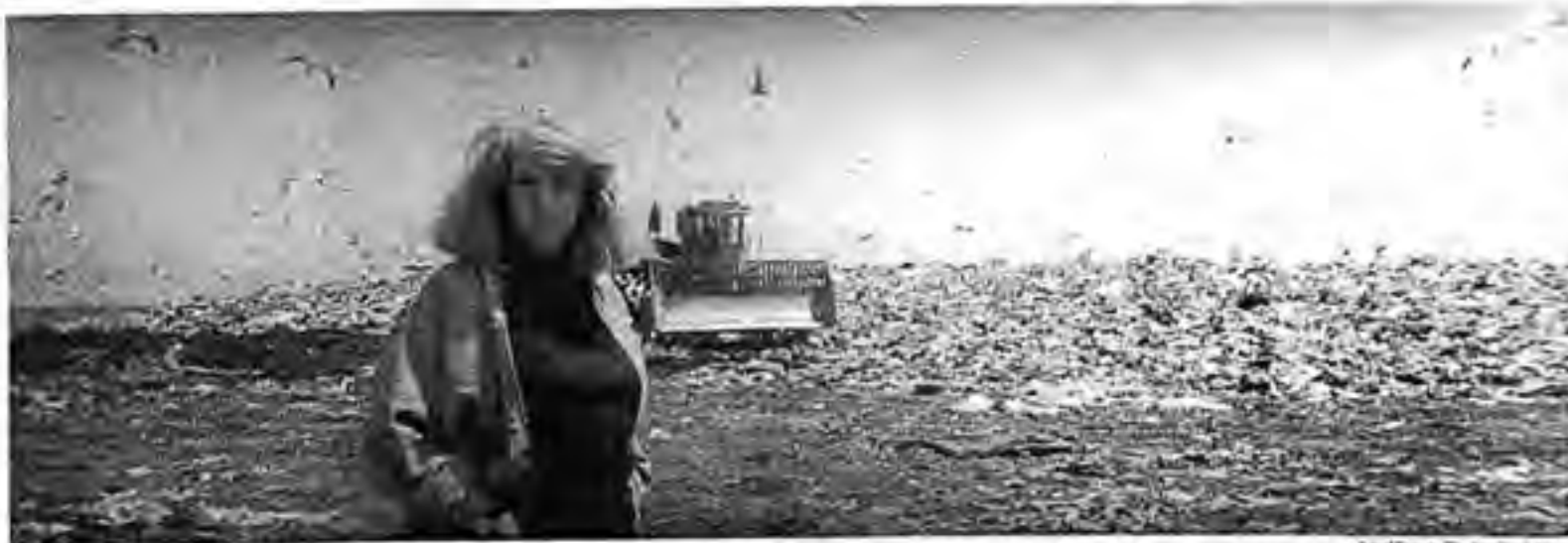
Mierle Laderman Ukeles, the New York City Sanitation Department's artist in residence, visiting the Fresh Kills landfill on Staten Island.