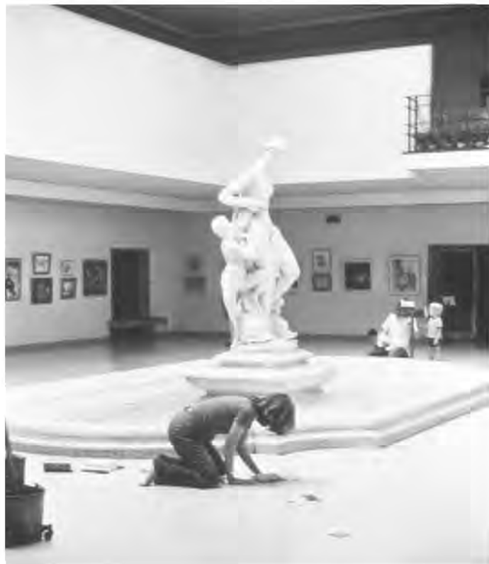
Mierle Laderman Ukeles, Hartford Wash: Washing Tracks, Maintenance Inside , 1973 (photos: courtesy Ronald Feldman Fine Arts).

Certainly, in step with other practices of the period that directed their attention to the institutional framework of art, Ukeles’ cleaning frenzy exposes the museum’s appearance of neutrality and purity as artifice—an artifice that requires the repression of (the signs of) bodies and time. But in Ukeles’ case, this repression is given a more complex articulation than that of a faceless institutional interdiction. The appearance of timelessness and eternal stasis, or simple orderliness, in fact, requires work. It requires the kind of work that not only erases the marks of bodies and time, such as dirt, dust, and decay, but work that continuously erases the marks of its own labor (including the body of the laborer). It’s the kind of