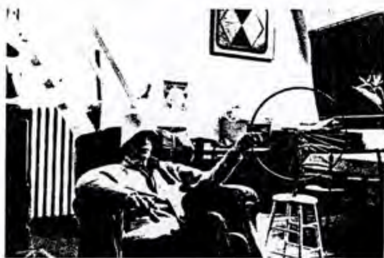
Marcel Duchamp, in his studio at 5 Rue Parmentier, Neuilly-sur-Seine, 1951.

equality, established and insured by the ability to enter freely into contract, is always already flawed, as it rests on the inequality of the sexual contract which allows men to have power and jurisdiction over women. One manifestation of this inequality is the unpaid work of (house)wives. She writes: