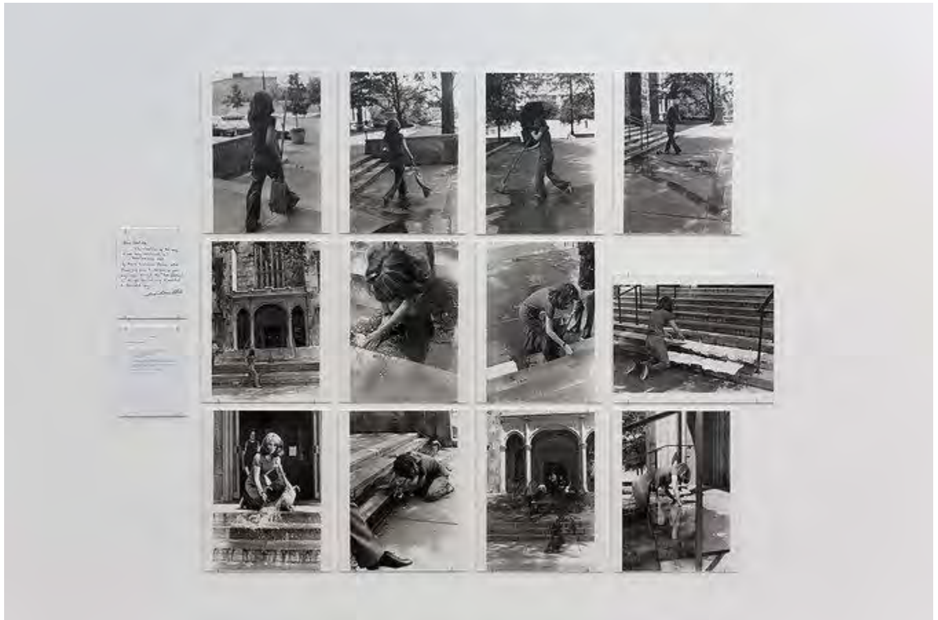
“Washing/Tracks/Maintenance Outside” by Mierle Laderman Ukeles.

After being shown the ropes by the Athenaeum staff, she locked and unlocked galleries; polished display cases; and two days later returned, alone, to wash the museum's front step on her hands and knees. Photographs of the washing are now classic 1970s images. In them, feminism, institutional critique, sly humor and self-possessed humility unite. It's a wonderful image, heroic in a sneakers-and-jeans way, a power of example, a reminder that it's high time some of our filthy rich 21st century museums got a scrub-down.