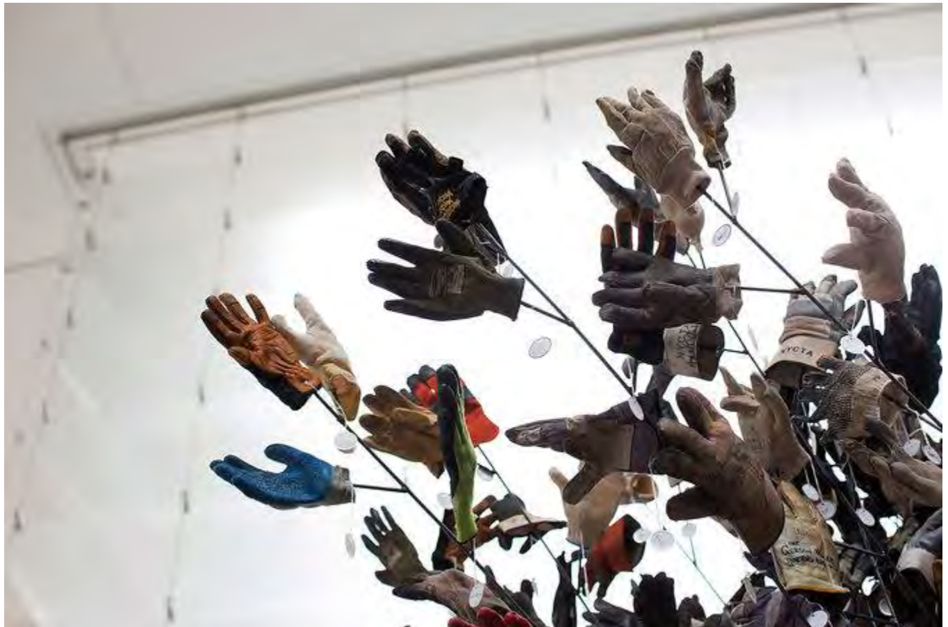
Ms. Ukeles's "Ceremonial Arch IV."

And she was furious. So she sat down and started to write a clarifying, role-redefining letter-of-intent-to self. She titled it “Manifesto for Maintenance Art 1969!” and it read, in part: “I am an artist. I am a woman. I am a wife. I am a mother. (random order). I do a hell of a lot of washing, cleaning, cooking, renewing, supporting, preserving, etc. Also, (up to now separately) I ‘do’ art.”