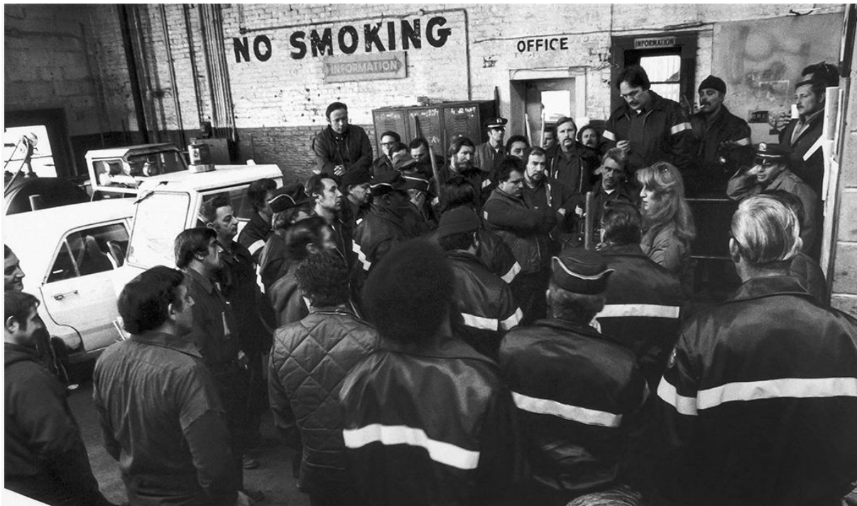
Mierle Laderman Ukeles, "Touch Sanitation Performance: Sweep 7, Staten Island, 6:00 a.m. Roll Call," 1978-80 (performance), 2007 (photo)