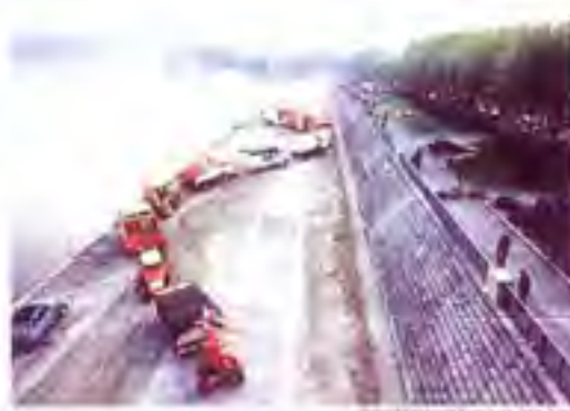
Mierle Ukeles at the Fresh Kills landfill on Staten Island in February. At left, her 1993 "ballet" for 27 trucks, 3 barges and 100 tons of recycled glass, on the wharf and river at Givors, France