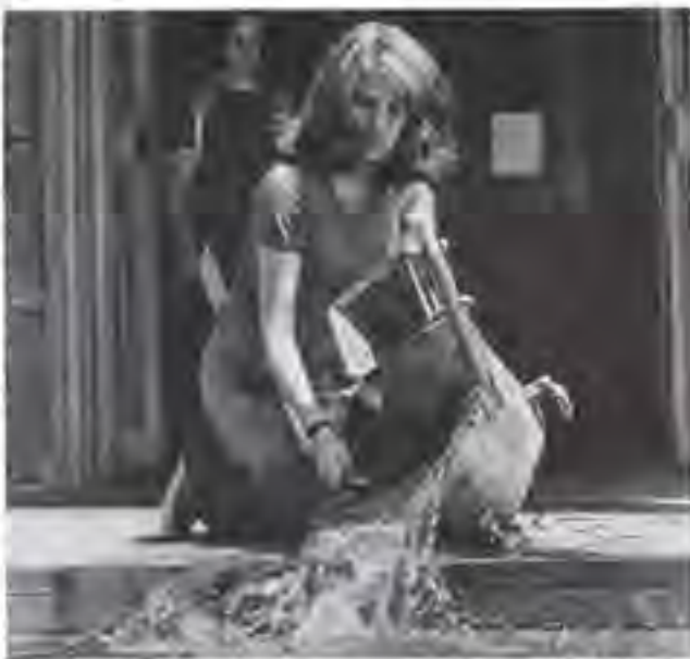
"Washing Trucks, Maintenance," an eight-hour performance by Mierle Ukeles at the Wadsworth Atheneum in Hartford in 1973.

"I've been waiting to get to work," she says. "Fresh Kills could be a great national asset, an international model. There are thousands of degraded places, brownfields, in the world. If this can be done at a high level, in terms of design and public process, it could be a model for the work of the next century. It could make people all over the world say: 'We could do something like that.' That's what I want."