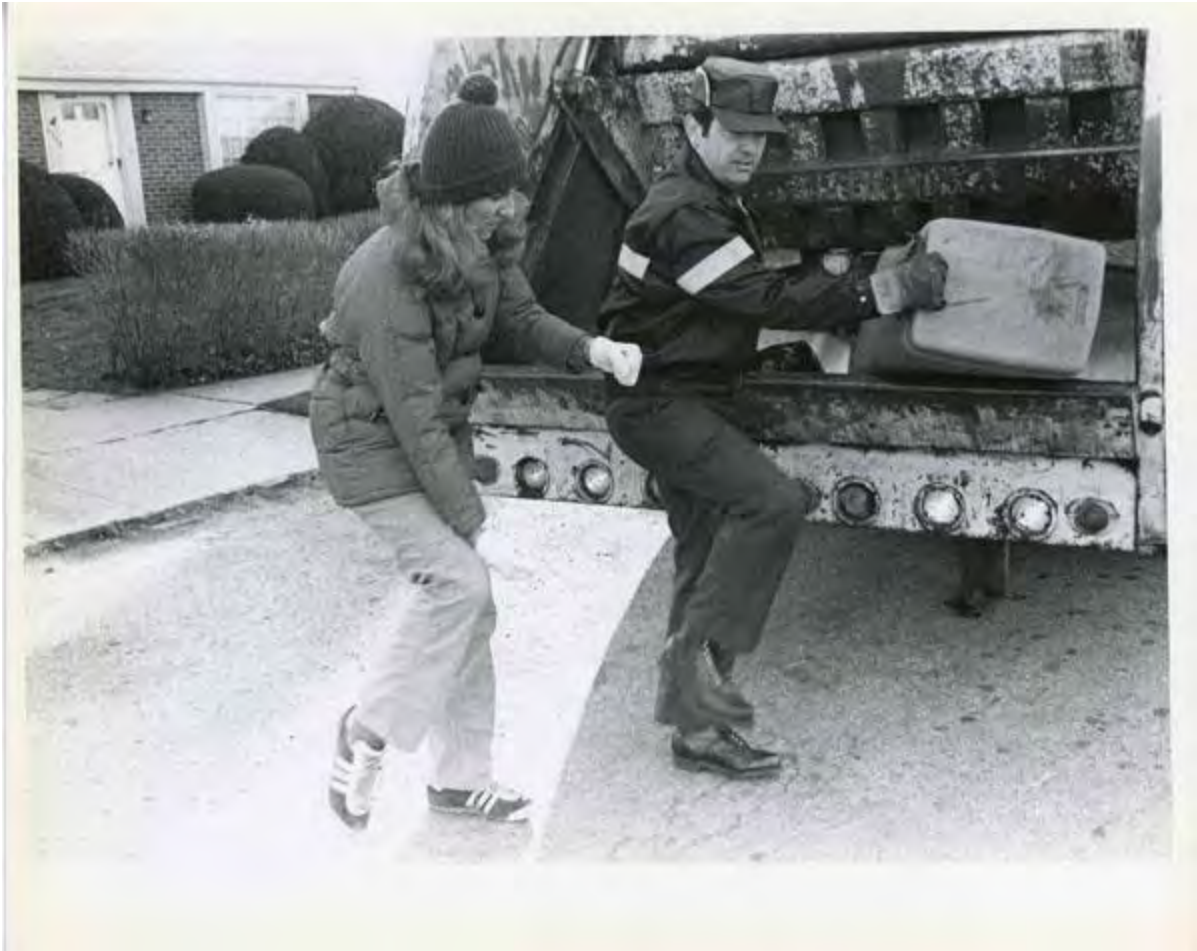
Mierle Laderman Ukeles, Touch Sanitation , 1979 – 80. Citywide performance with 8,500 Sanitation workers across all fifty-nine New York City Sanitation districts.

Ukeles: Yes, ma'am! And I did it in one shot.