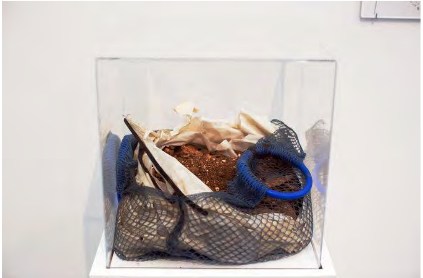
“Maintain Your Destiny: Earth Exchange: Ransom Piece” by Ms. Ukeles, at the Queens Museum.

The manifesto — four typewritten pages hanging alone on a wall — marks the chronological start of the show, which flows through galleries that wrap around the museum's high -ceilinged atrium. The initial examples of Maintenance Art were modest chamber pieces, at-home performances: dress the kids (by the early 1970s she had two); sort the socks (she arranged black ones into calligraphic characters); photograph everything; and (this came later) stamp the documentary results with an authenticating seal.