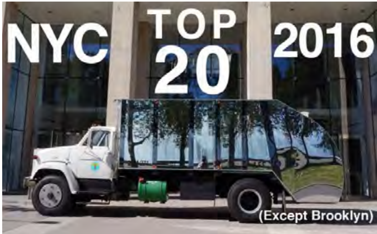
(photo of Mierle Laderman Ukeles, "The Social Mirror," outside the Queens Museum)

New York is no longer the center of the art world, its art scene is doomed, and artists are fleeing because the rent is too damn high. Writers can declare all sorts of doomsday scenarios, but the fact remains: New York is still an incredible place to see art. This list of 20 exhibitions (plus honorable mentions) barely scratches the surface of the city's artistic offerings this year, from overdue retrospectives to surprising sides of artists we know well. It provides a small comfort: 2016 may have been really shitty, but at least we saw some really good art.