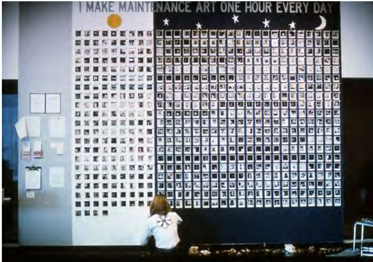
Mierle Laderman Ukeles, I Make Maintenance Art One Hour Every Day , September 16 – October 20, 1976. Performance with three hundred maintenance employees, day and night shifts over the course of six weeks at 55 Water Street, New York. Installation at Whitney Museum Downtown at 55 Water Street. 720 Polaroid photographs mounted on paper, printed labels, color-coded stickers, seven handwritten and typewritten texts, clipboard, and custom-made buttons, overall: 12 x 15 feet.

Rail: There's an issue of visibility in all of this: what work gets seen, what people get seen. It seems like your use of photography really brought that to the fore.